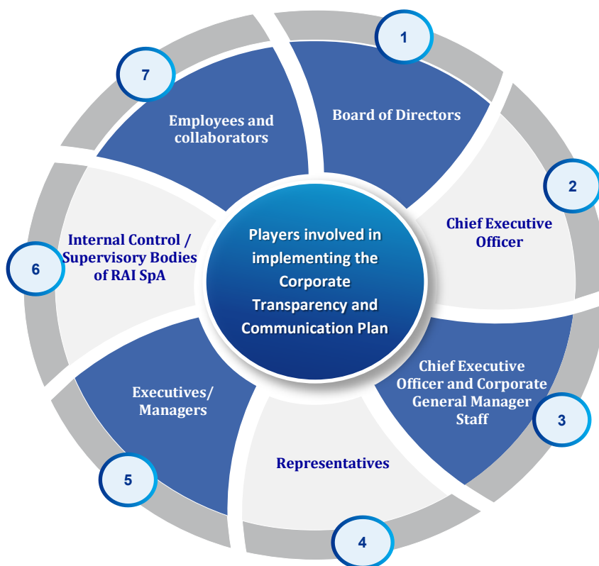
Figure 1: The players involved in the process of implementing Transparency

In summary, the parties involved in the implementation process of the Transparency within RAI S.p.A are: